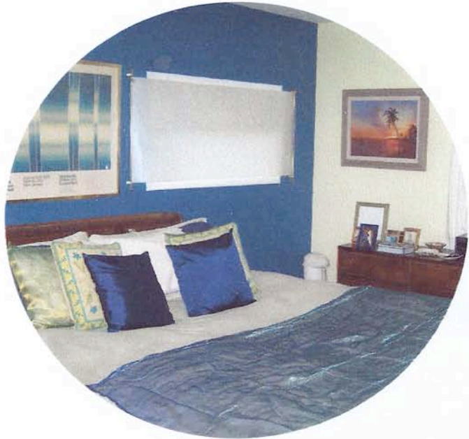
COOL BEDROOM at the caregiver center at Northern Westchester.

In control. When you're in a hospital or office, you're not in control. You're not in control of your environment. You're not in control of your schedule. You're not in control of your time. You're not in control of your space. You're not in control of your life. You're not in control of your future. You're not in control of your destiny. You're not in control of your fate. You're not in control of your luck. You're not in control of your karma. You're not in control of your destiny. You're not in control of your fate. You're not in control of your luck. You're not in control of your karma.